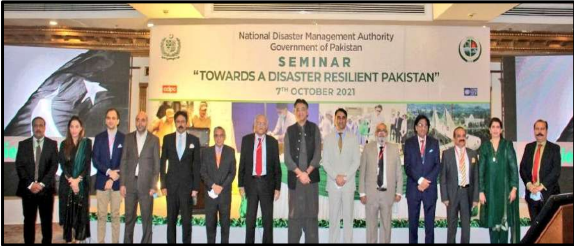
National Resilience Day Seminar on the theme of “Towards a Disaster Resilient Pakistan”