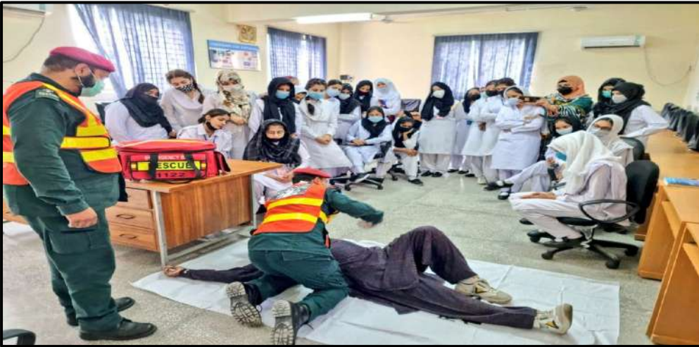
Basic First Aid Training in designated schools of ICT – 4 th - 13 th Oct 2021