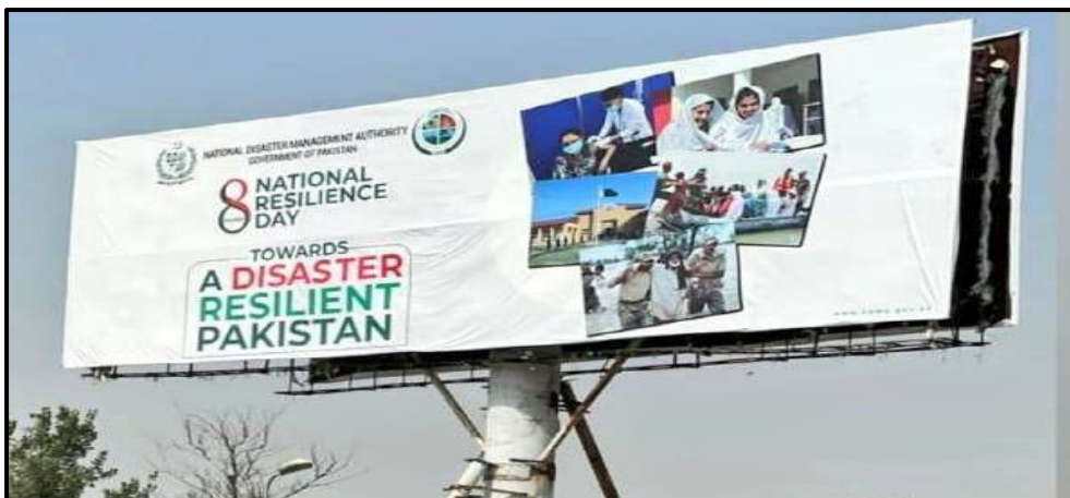
Public awareness campaign through city branding – 8 th Oct 2021